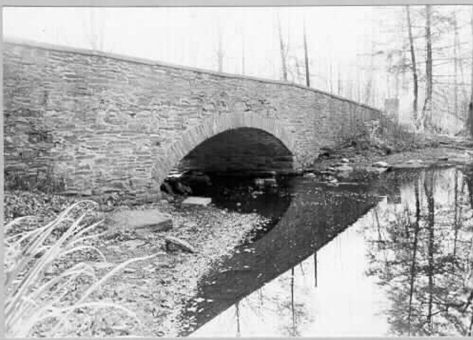
View from south

13. MAP: see continuation sheets Acreage: less than one