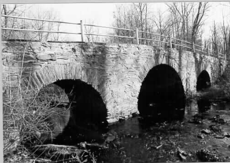
View from northwest

13. MAP: see continuation sheets Acreage: less than one